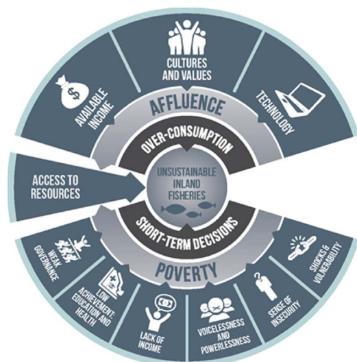
Fig. 1. Characteristics of affluence and poverty (outer ring) can lead to unsustainable choices (inner ring). When coupled with access to resources, affluence can lead to over-consumption and poverty can lead to short-term decisions that result in unsustainable practices for inland fisheries.

Poverty is driven by a range of complex political, cultural, environmental, and economic factors (see Hulme et al., 2001 ), and these factors shape the links between poverty and inland fisheries ( Fig. 1 ).